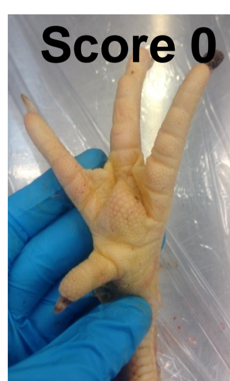
No or very minor lesions