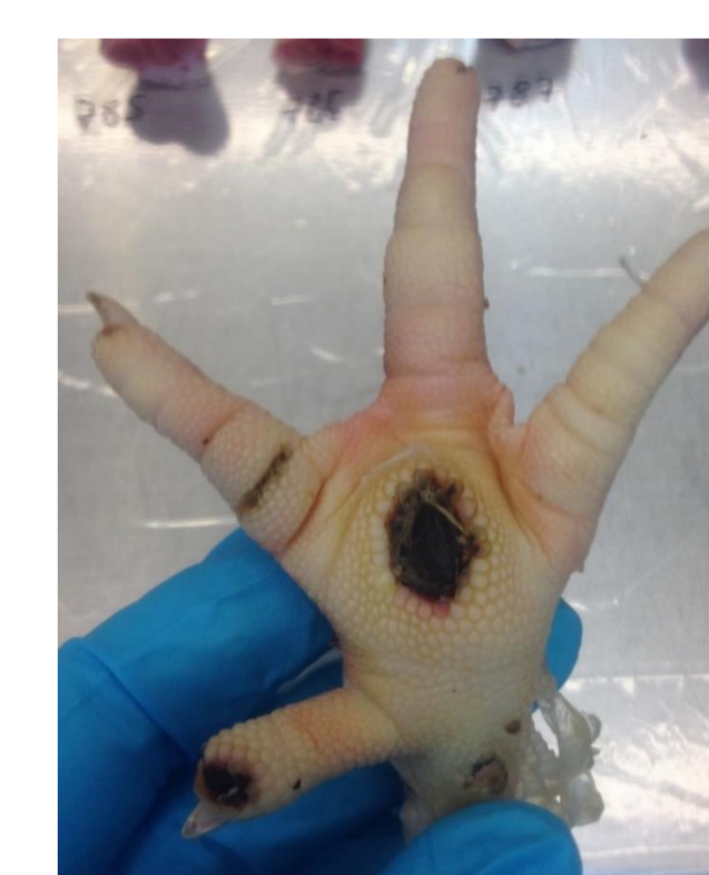
Loss of tissue