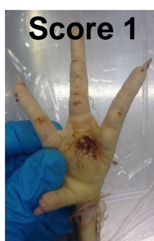
Less severe lesions