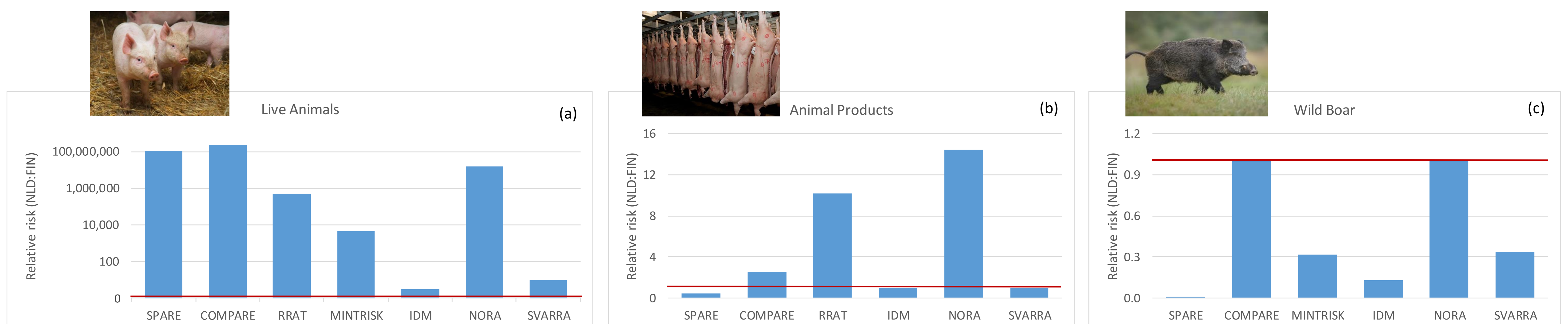
Figure 1. Relative risk of introducing ASF into the Netherlands compared to Finland in the base scenario (2017 situation) by (a) trade in live animals, (b) trade in animal products, and (c) movement of wild boar; a relative risk above 1 (red line) denotes the Netherlands has a higher risk than Finland, while a relative risk below 1 denotes Finland has a higher risk.