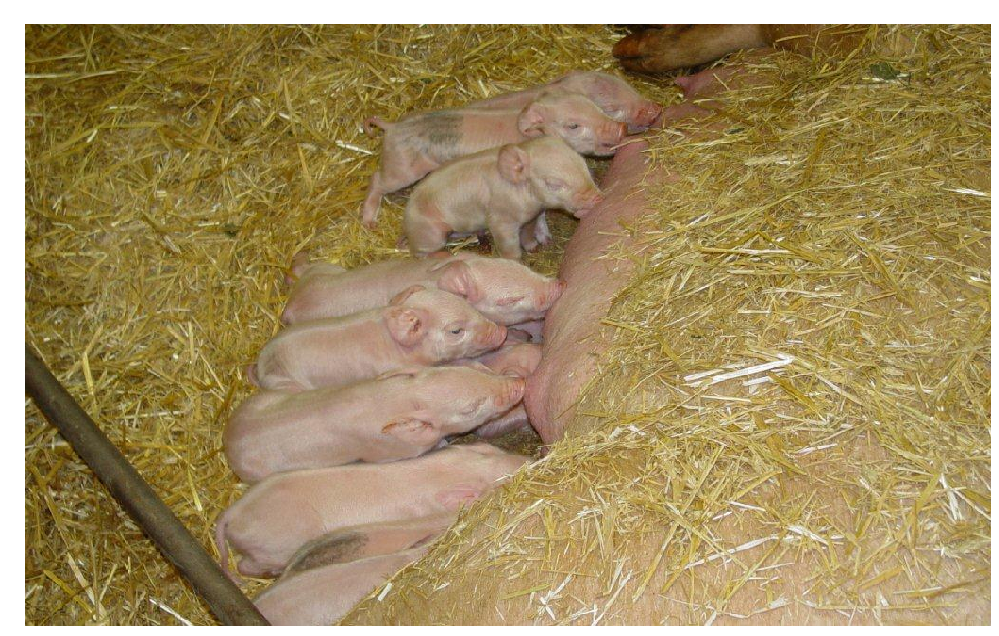
Fig.1. Sows that give birth to a moderate sized first litter have a bigger chance to have a second litter, stays longer in production and have a higher total production of piglets than sows with a small or large first litter.

Sows in category 2 to 4 (8 to 13 piglets) were the ones having the highest stayability and the best lifetime production (Fig. 2). Univariabel logistic regression for stayability from first parity to second parity for sows in category 1 and 6 compared with category 4 had an OR of 0.7.