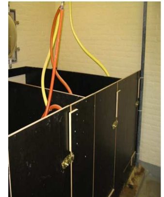
Fig. 1 Transmission chain and picture of the stable